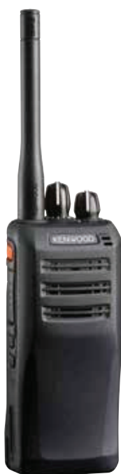
TK-D200(G)/D300(G) Non-keypad, non-Display model