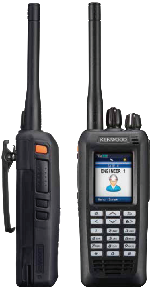
TK-D200(G)/D300(G) Display model