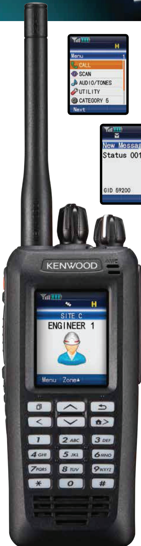
Actual size TK-D200(G)/D300(G)